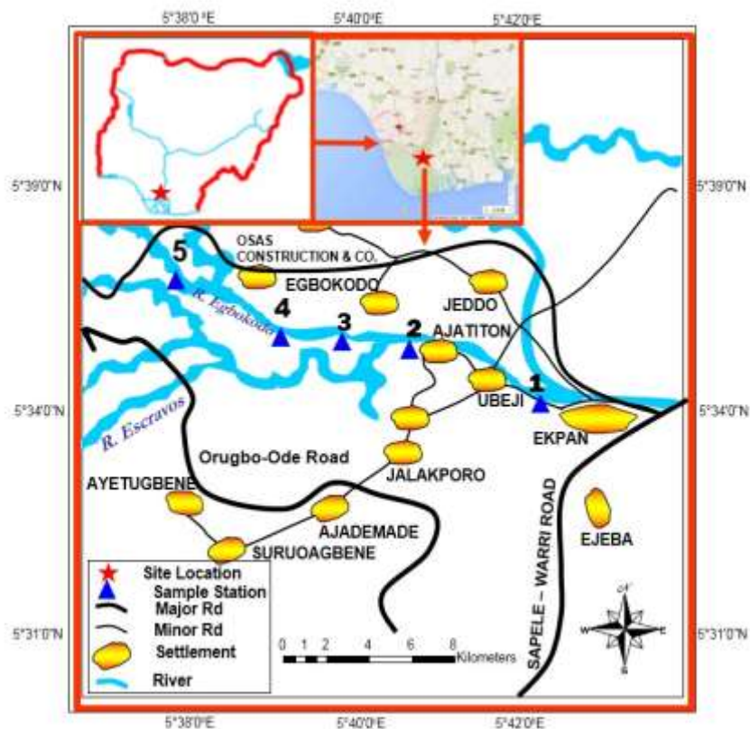
Figure 1. Map of study area showing sampling sampled stations

Five (5) stations were chosen at relevant points of anthropogenic activities along the stretch of the river. Station 1 was located far upstream; away from the disturbed locations. Minimal anthropogenic activities were observed at this location; hence labelled as the control station. Station 2 was located about 430 metres downstream from Station 1. Inhabitants of the surrounding communities use water of the river for washing, bathing and laundering. It was observed that the dwellers of the surrounding communities also dump faeces, kitchen wastes, and other organic domestic wastes at this section of the river. Station 3 was located about 180 metres downstream from Station 2. Manual dredging activities was constantly carried out by a company called Osas Construction Company at this section of the river during the period of sampling. Station 4 was located about 150 metres downstream from Station 3. A vandalized oil pipeline (point source pollution) is located at this section of the river. Station 5 was chosen about 430 metres downstream from Station 4. Immense fishing activities predominate this section of the river.