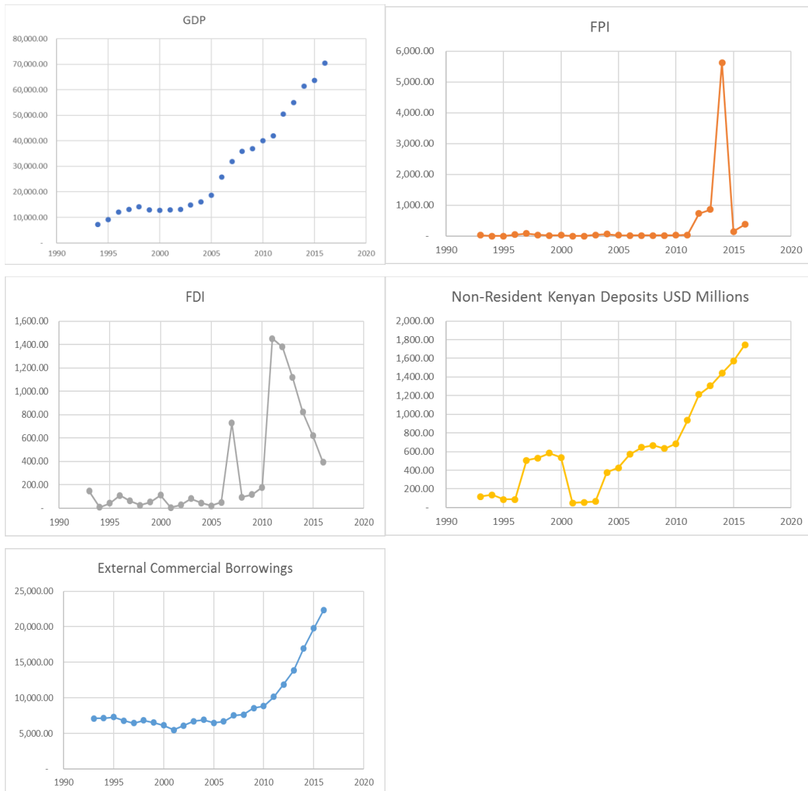
Figure 4.1: Annual Trend Analysis for the study variables in USD millions

The study performed annualized trend analysis on the variables for the period of study. The results are plotted in figure 4.1 below;