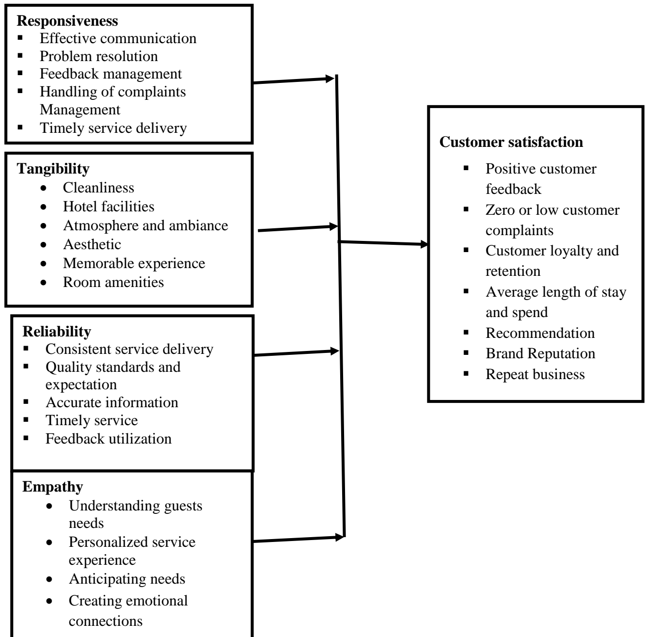
Figure 1: Conceptual Framework