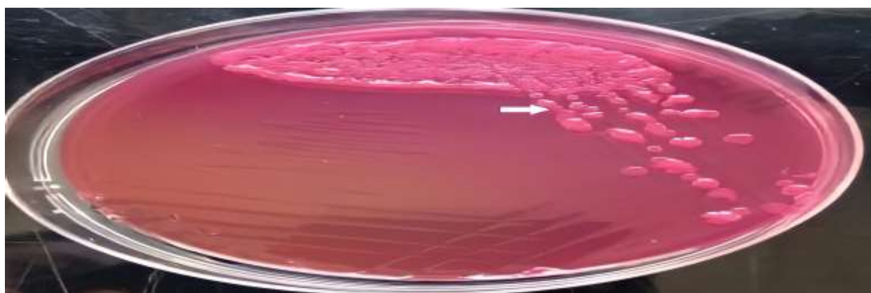
Figure 1: Pink Colonies of Escherichia coli from Food Sample on a Macconkey Agar. Arrow Showing Single Colony of E.coli

The presence of characteristics colonies of Escherichia coli was noted as medium size pink colonies as illustrated in figure 1. Out of 137 food samples obtained from selected food establishments, cumulatively 24.1% (n=33) were found to be contaminated with Escherichia coli . Hotels had high number of samples with E. coli at 33.3% (n=12) from hotels followed by food kiosks at 25% (n=13), 17.6% (n=6) from food cafeteria and 13.3% (n=2) from restaurant. Foods obtained from hotels and food kiosks were highly contaminated with E. coli