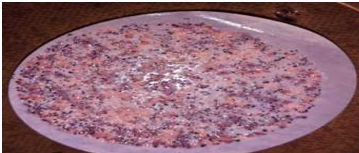
Figure 5: Green Metallic Sheen of E. coli on EMBA Media. Arrow Pointing Colonies of E. coli in an EMBA Media