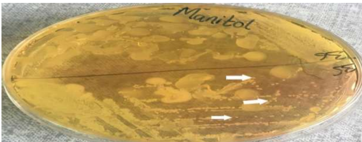
Figure 3: Tiny Yellow Colonies of Staphylococcus aureus on Mannitol Media Arrows Showing Single Colonies of Staphylococcus aureus

The colonies of Staphylococcus aureus were tinny yellow on mannitol plate as illustrated in figure 3. Thirty-two percent 32.8% (n=45) of samples had Staphylococcus aureus . Food cafeterias were with highest percentage of samples with S. aureus 61.8% (n=21), followed by hotel at 28.8% (n=10), 20% (n=3) samples were from restaurants and 19.2% (n=10) of samples were from food kiosks. Majority of samples contaminated with S. aureus were from food cafeteria.