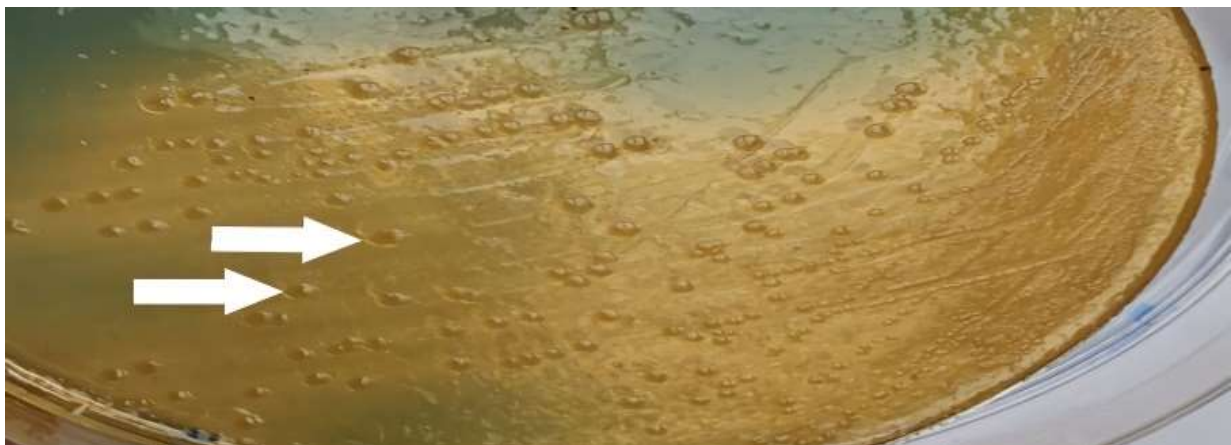
Figure 2: Yellow Tiny Colonies with Opaque Centers and Translucent Edges Colonies of Vibrio cholera. Arrows Showing Single Colonies of Vibrio cholera

The characteristic of Vibrio cholera colonies appeared as yellow tinny on Thiosulfate Citrate bile salt(TCBS) plate as demonstrated in figure 2. Cumulatively, 23.4% (n=32) of the total samples had Vibrio cholera , where 38.2% (n=13) of samples were from cafeterias, 26.7% (n=4) samples from restaurants, 19.4% (n=7) samples from hotels, 8(15.4%) samples from food kiosks. Food cafeterias had the highest number of positive samples with Vibrio cholera