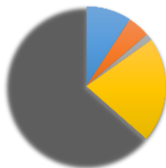
Figure 4: Investigations done to the children aged \leq 12 years admitted to hospitals in Nyeri County, 2013