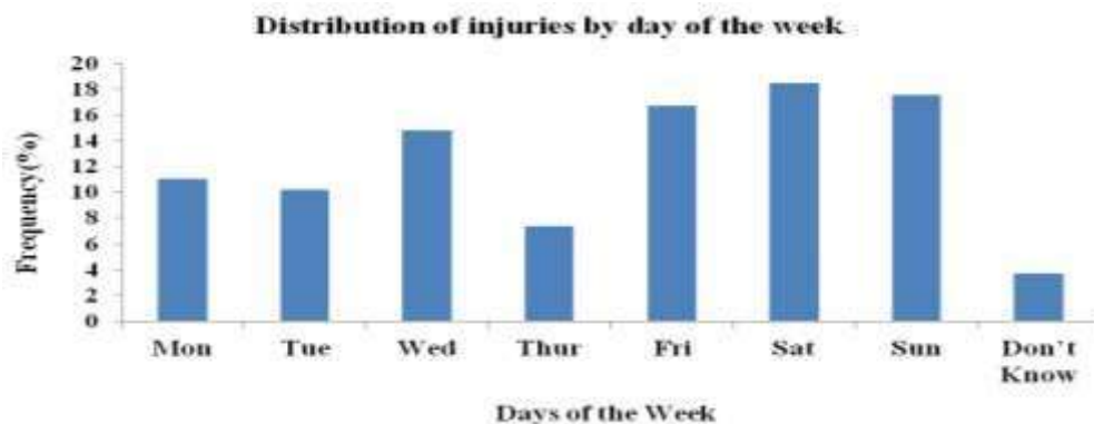
Figure 2 Distribution of injuries by day of the week, in the three in hospitals in Nyeri County, 2013

Although half of the injuries occurred on Friday, Saturdays and Sundays there was no particular trend across the days of the week as shown in figure 2