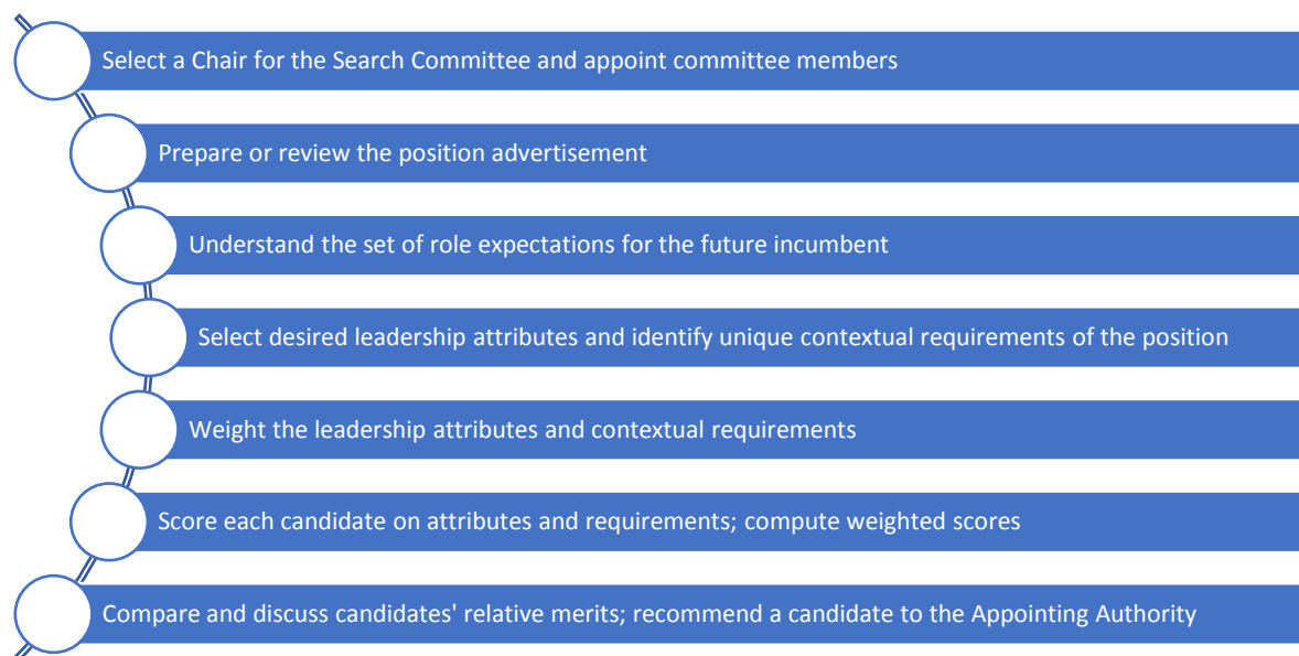
Figure 1: Sequential Flow of the Search Process

Ultimately, subjective judgment in selecting a candidate is inescapable, but there are ways to lower the degree of subjectivity. In this article, we suggest an approach to structure search committee processes noted in Figure 1 below.